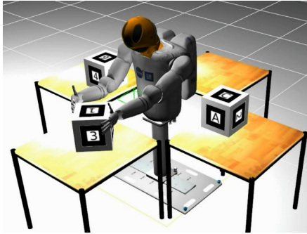
Fig. 2. The simulated Robonaut 2 interacting with an ARcube.

an action. This process is repeated 10 times. At the end of each trial the robot determines the likelihood that the presented object is novel and the most likely existing object in memory is identified.